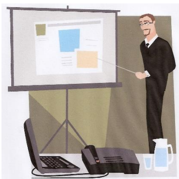
Laptop & data projector

You will need the following equipment/books for your classroom: